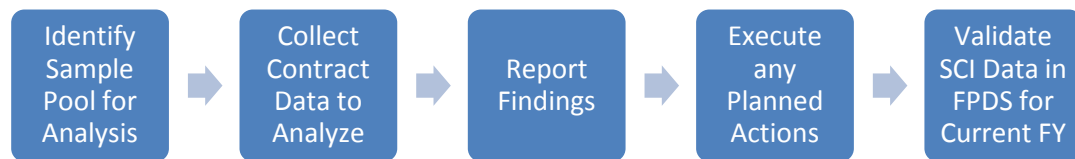
Figure 1: Analysis Process

In preparation of the Service Contract Inventory and Analysis Report, a working group was established consisting of representatives from each of DOC's five Bureau procurement offices. As a result of the collaborative effort of the working group, a repeatable process, as depicted in Figure 1, was developed to comply with the annual service contract inventory requirements.